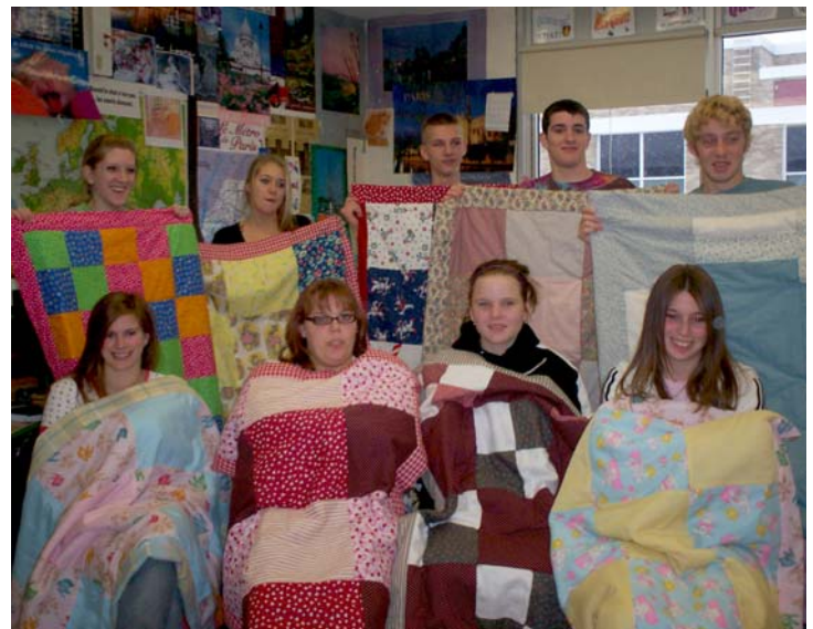
French class quilts were donated to community members