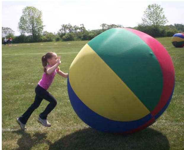
It's bigger than me!