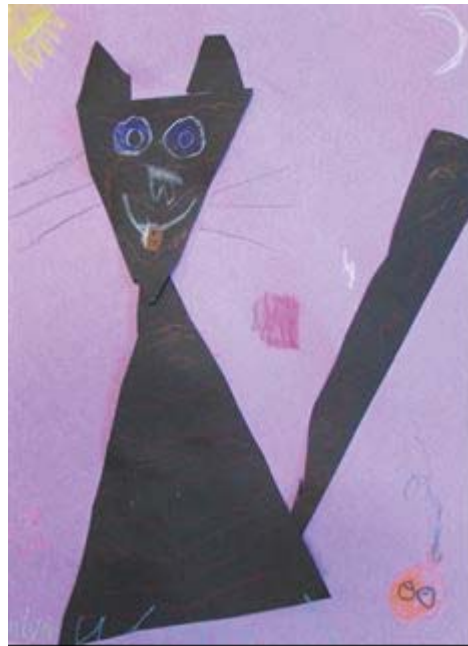
Adalyn Sheils, kindergarten