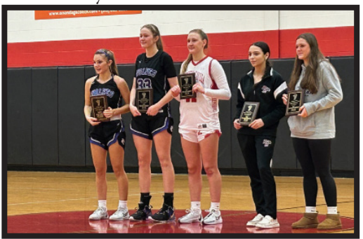
Girls' All-Tournament Team

You can check out the Southern Cayuga Athletics website and follow us on X - formerly Twitter - @SCAthletics2