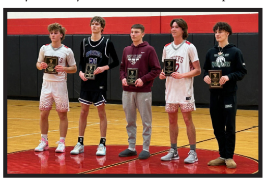
Boys' All-Tournament Team