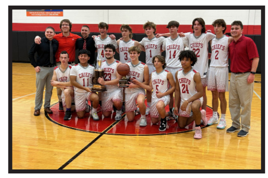
Boys' Varsity Tournament Team Champions

Wishing all the winter sports teams continued success, and looking forward to the achievements of the Southern Cayuga student-athletes in the coming seasons!