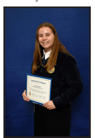
American FFA Degree