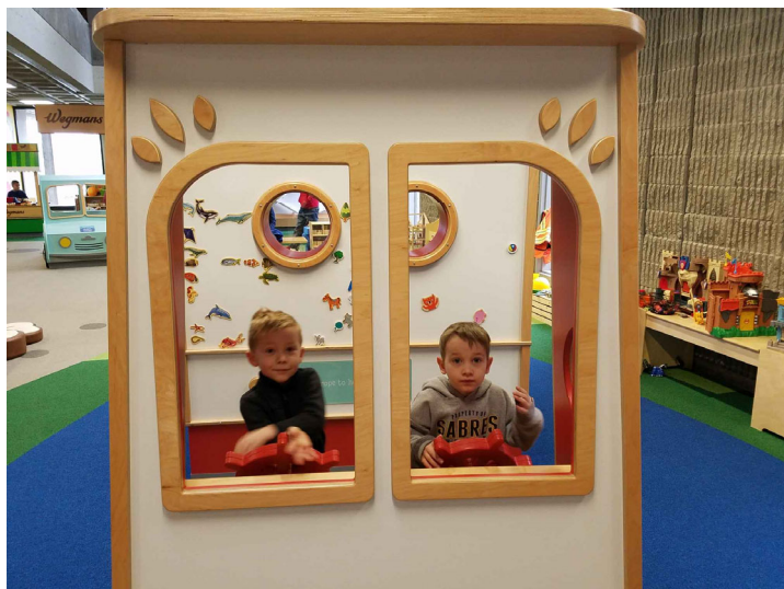
Two young Head Start sailors enjoy playing on Play Space boat

On a sunny day in October, the Southern Cayuga Head Start class boarded a school bus for a trip to Auburn and the Play Space at 63 Genesee Street. Parents and teachers alike were looking forward to watching their preschool students learn through play. A few families had visited the Play Space, and their children were describing the fun they had playing on the boat, building huge forts and designing meals for their farm to table play area. The Play Space brings children and their families together through play and values its welcoming and inspiring space for children birth to six. For more information about the Play Space visit https://www.playspaceabc.com/ . For more information about our Head Start program contact www.cscda.com .