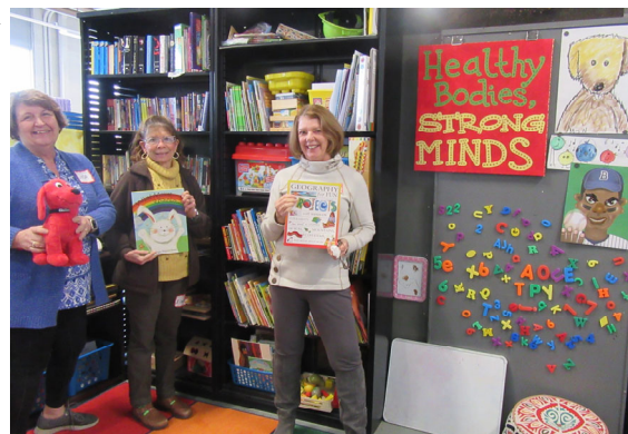
Photo: Three volunteers prepare to welcome children and their parents to the King Ferry Food Pantry's Healthy Bodies Strong Minds area, where participants will find reading and problem solving activities to support educational success and self-sufficiency.

The Healthy Bodies, Strong Minds area offers a safe and educational learning environment for children birth to age 12 whose parents are using the King Ferry Food Pantry during regularly scheduled hours on the first and third Saturdays of each month. This program provides time, space and adult encouragement for children to read, play educational games, and select books for their home libraries. We share the Southern Cayuga Central School's goal that children read with an adult every day. Volunteers for this program are recruited for their ability to work with children, understanding of children's literature, emergent literacy, child development and other educational skills and experiences. For more information about this program, contact Elaine Meyers at (315) 364-8986.