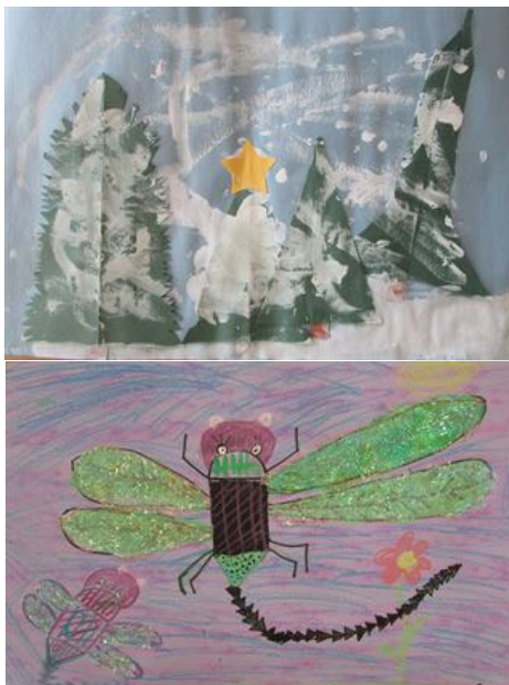
Alana Dunman, kindergarten